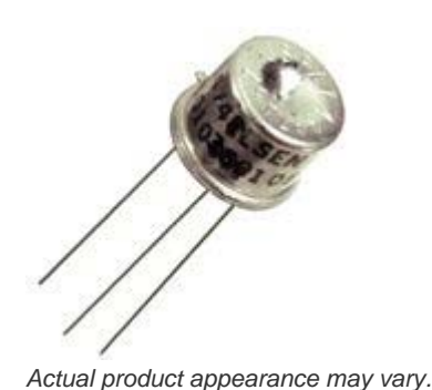
3601 Series TO-5 Thermal Switches